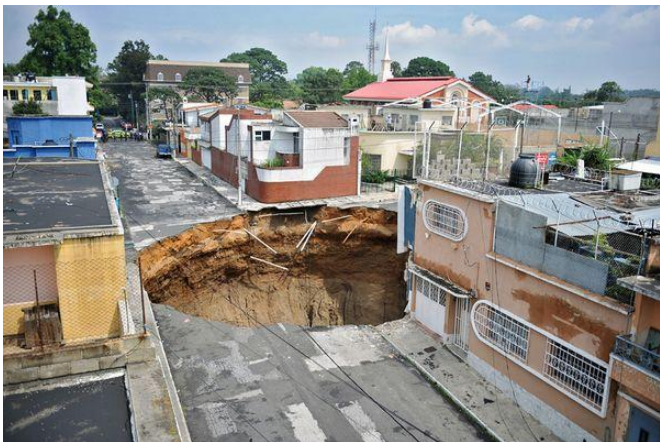
Fig. 14 Giant Sinkhole Pierces Guatemala – 2010

An interesting case of an unprotected sinkhole is presented above in Figure 13 showing a car fell into an Ottawa Sinkhole on Highway 174 in Canada in 2012.