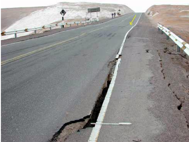
Figure 4 Pan American Highway Bridge Abutment Damage in Moquegua, Peru After 2011 Earthquake

As an example of damage due to earthquake, Figure 3 shows collapse of few sections of the 1464 feet long Baihua Bridge along Dujiangyan-Wenchuan Highway in China after the 2008 Wenchuan Earthquake,