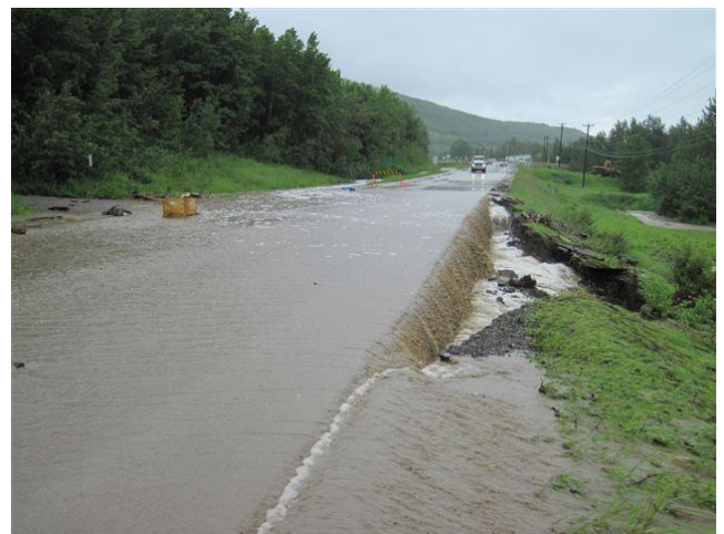
Fig. 7 Flooded Highway 97, Pinepass- Chetwynd – USA

Example shown above in Figure 6 is the North Carolina Coastal Highway over-wash during an storm event in 2006.