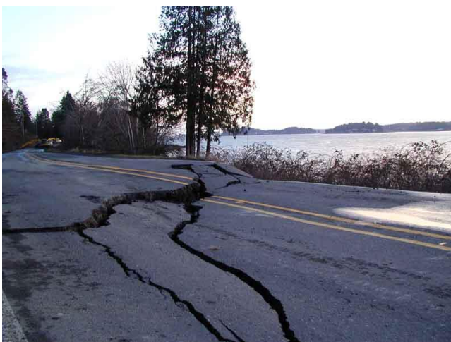
Fig. 10 Extensive road damage during 2011 Nisqually Earthquake in Washington

Lack of geological/geotechnical characterization of a project site can lead to problems like sinkholes, especially in areas of Karst topography.