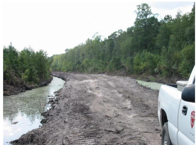
Fig. 16 Mile long road under construction through wetland

Figure 15 above shows the collapsed section of Santa Monica Freeway (I-10) in Los Angeles, California and Figure 16 shows a one mile long road under construction in Mississippi.