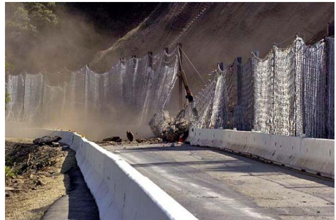
Fig. 12 2006 Rock-Slide - Highway 140 near Yosemite, CA

The example presented in Figure 9 shows Landslide damage at Capitol Lake, Olympia during 2011 Nesqually Earthquake in Washington, while Figure 10 shows the Road Damage due to the same seismic event.