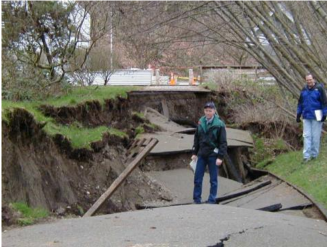
Fig. 9 Landslide Damage – Capitol Lake, Olympia after 2011 Nisqually Earthquake in Washington

As shown in Figure 11, severe landslide damage occurred at Golden Bay, Nelson, New Zealand.