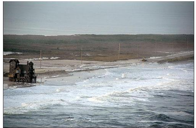
Fig. 6 North Carolina Coastal Highway 12 Overwash – 2006

Lack of attention to proper flood protection and drainage systems in earlier designs contributed to many pavement failures during or after major storm events.