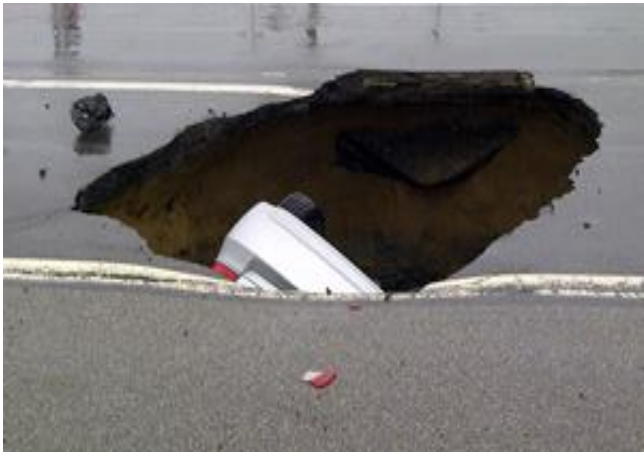
Figure 13 A Car fell into Ottawa Sinkhole in Canada – 2012

An interesting case of an unprotected sinkhole is presented above in Figure 13 showing a car fell into an Ottawa Sinkhole on Highway 174 in Canada in 2012.