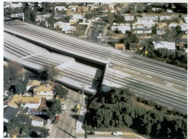
Fig.15 Collapsed Section of I-10 (Santa Monica Freeway) Los Angeles, California, Built on drained wetland

Congested urban areas and lack of alternative routing can often challenge a transportation engineering team to design a road passing over wetlands or soft soils. Examples shown above are: m) Collapsed section of Interstate I-10 (Santa Monica Freeway) built over a drained wetland in a congested urban area in Los Angeles, California and n) A one mile long road under construction through wetland.