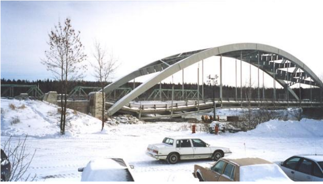
Fig. 17 Sergeant Aubrey Cosens Memorial Bridge - Highway 11 Lactford, Canada – damaged in extreme cold weather in 2003

An example of structural damage in extreme cold temperature shown in Figure 17 is the Failure of Sergeant Aubrey Cosens Memorial Bridge along Highway 11 in Lactford, Canada due to extreme cold weather in 2003.