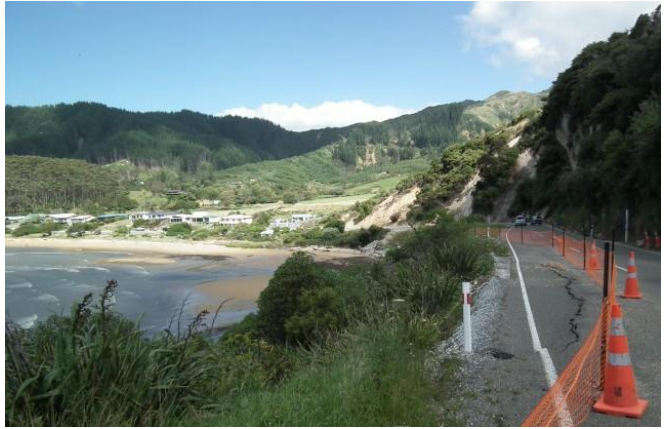
Fig. 11 Landslide Damage - Golden Bay, Nelson, New Zealand

Landslides and rock slides may be triggered by seismic events, slope saturation from storm events, combined with weakened shear zones along bedding planes parallel to the slope.