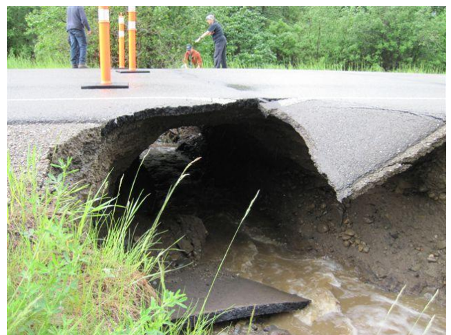
Fig. 8 Highway 97, Pinepass- Chetwynd – USA Flood Damage

As a recent example of flood damage after severe storm event in 2011, Figure 7 shows the flooded Highway 97 from