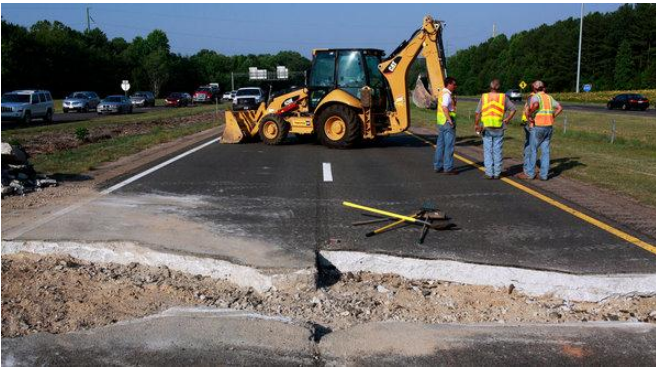
Fig. 18 Damage due to extreme heat in a concrete pavement

An example of structural damage in extreme cold temperature shown in Figure 17 is the Failure of Sergeant Aubrey Cosens Memorial Bridge along Highway 11 in Lactford, Canada due to extreme cold weather in 2003.