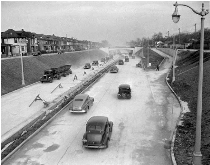
Fig. 1 Davison Highway, Detroit, Michigan – 1946

Transportation Authorities and Engineers have come a long way from the first Depressed Motorway in Detroit, Michigan, USA to Autobahn in Germany and Super Highways all around the world.