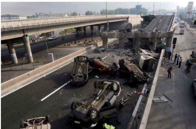
Fig. 5 Highway Collapse near Santiago, Chile – After 2010 Earthquake

Figure 4 is another example of damage during seismic event showing the Pan American Highway Bridge Abutment Damage in Moquegua, Peru after 2011 Earthquake. The yellow arrow in the picture shows the start of the abutment.