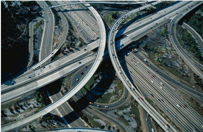
Fig. 2 Seven-Level Super Highway Interchange, California, USA

Figure 1 shows the Davison Highway in Detroit, Michigan, the first depressed highway built in the United States of America. Figure 2 shows a seven level urban highway interchange in California, USA.