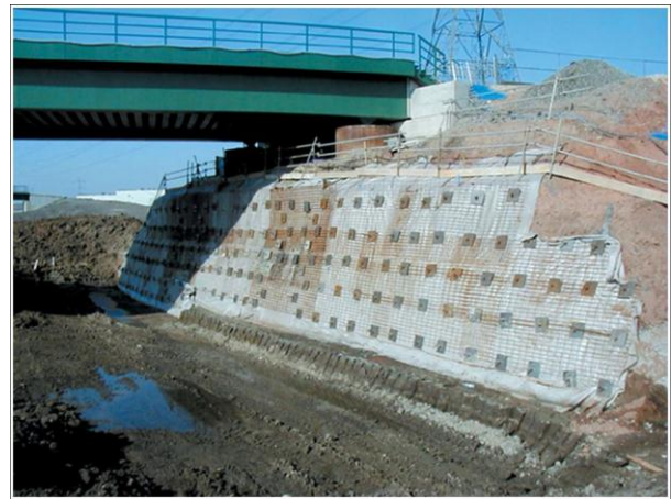
Fig. 20 Abutment Retaining System using Soil Nailing

8) Soil-nail retaining walls are being tested in some states with apparent success.