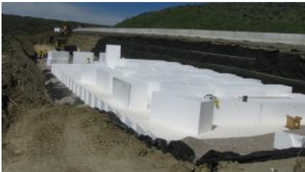
Fig. 22 Geofoam used for US 50 near Montrose, Colorado

An example of the use of Geofoam is shown in Figure 22 showing Geo-foam used for US 50 near Montrose, Colorado.