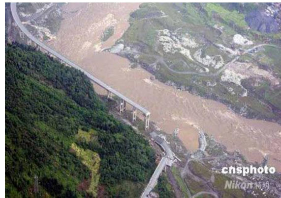
Fig 3 1464 ft Baihua Bridge/Viaduct, Dujiangyan-Wenchuan Highway, China - After 2008 Earthquake

Due to lack of knowledge and understanding, many of the earlier bridges and roads were not designed to withstand ground movement and liquefaction resulting from seismic events. For example, maximum damage during earthquake is dependent on peak particle velocity and not on peak particle acceleration as was the old belief.