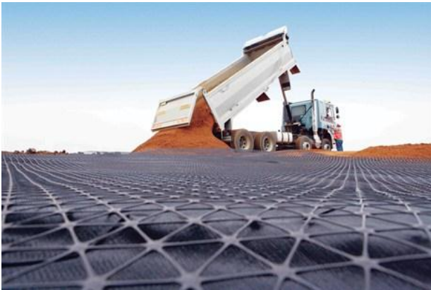
Fig. 21 Geosynthetics in Road Construction on Soft Soil