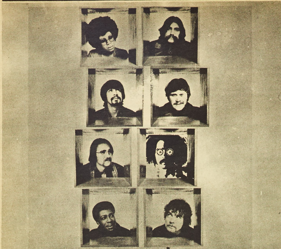
THE ROTARY CONNECTION