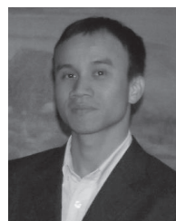
Scholarship in 2006.