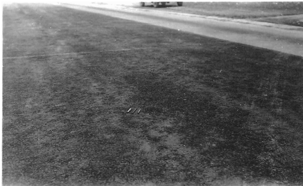
Figure 4 - Very good texture