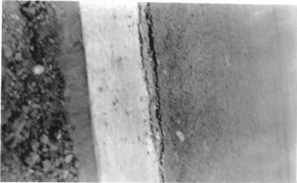
Figure 1 - Surface Cracks