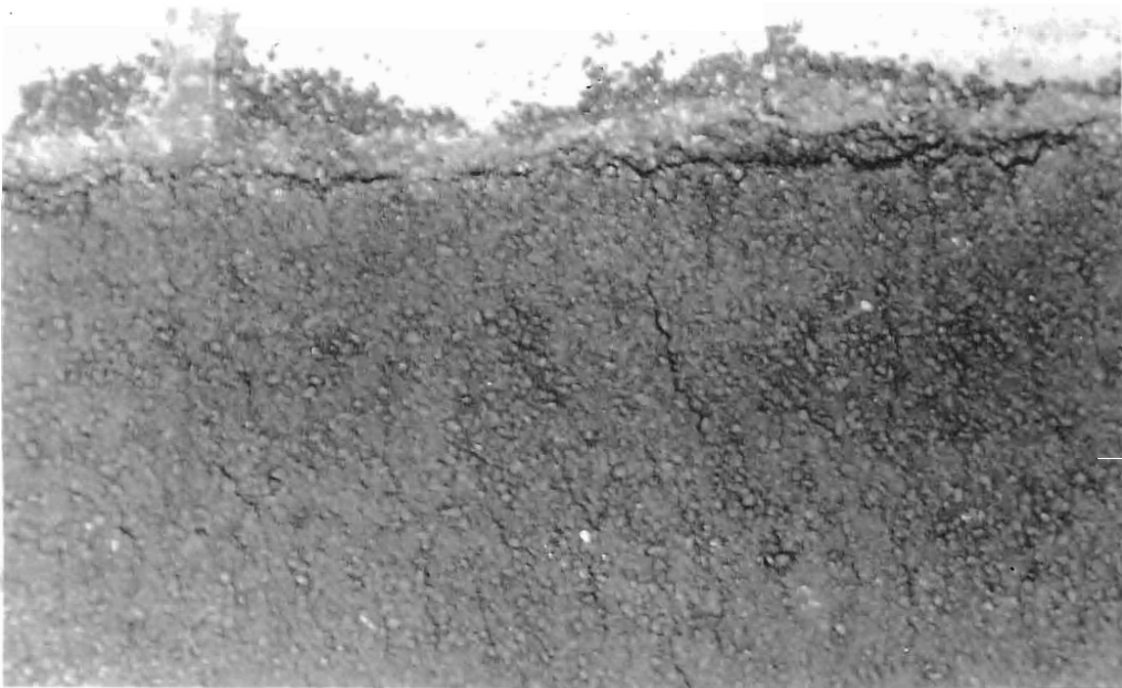
Figure 2 - Surface Cracks