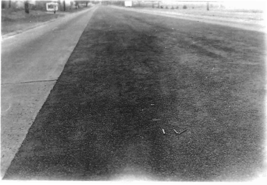
Figure 5 - Excellent non-skid surface

I realize that some will object to reducing the temperature of the mix or the weight of the roller as the last resort to stop surface checking for no doubt, this method will give you slightly less compaction or a little less strength. However, I believe it is much better to do that than to tear the inner structure of the pavement and leave cracks in the surface that will not heal. Traffic, in time, will render the desired compaction, but will never improve a cracked surface.