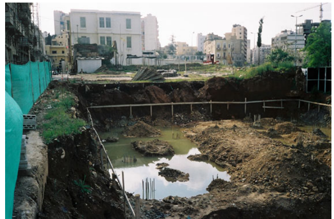
Photo 2 Excavation showing high water table in a red sandy area

On the other hand, slope stability is a major concern with the invasion of neighboring hills surrounding the Beirut suburbs. Sand and clay layers are found on those hills. With the galloping deforestation, slope stability becomes recurrent especially in winter time with incidence of mud flows during heavy rain season.