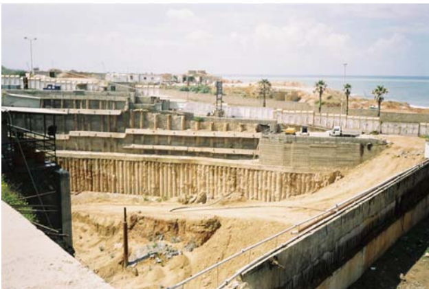
Photo 1 Excavation showing a shoring system in sand dune area

With the high value of property land and limitation in heights of structures, scarcity of parking spots as well as storage areas, developers are investing more on exploiting the underground. Deeper excavations and specialty foundations are part of the project investment. The close proximity of adjacent structures implies careful implementation of special retaining system.