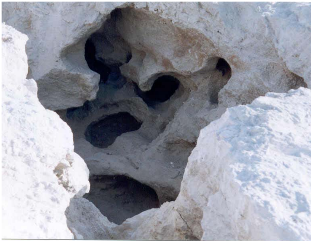
Plate: 2 A Typical Sinkhole at the Site