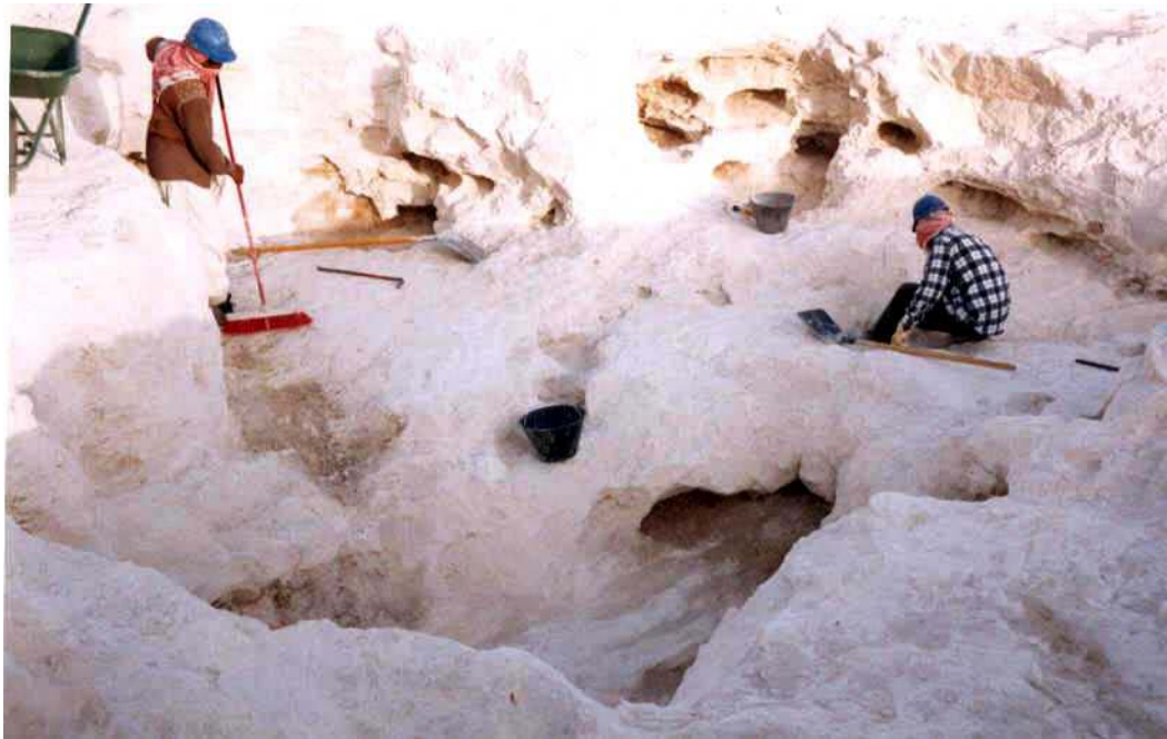
Plate: 3 Preparation being made for Treatment of Sinkhole at the Site

Thanks are due to the Project Manager & colleagues at Saudi Oger Ltd and R. G. M. E for their support through out the preparation of this Paper.