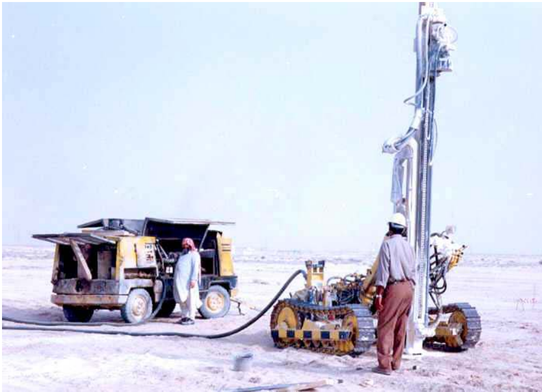
Plate: 1 Cavity Probing in progress at the Site