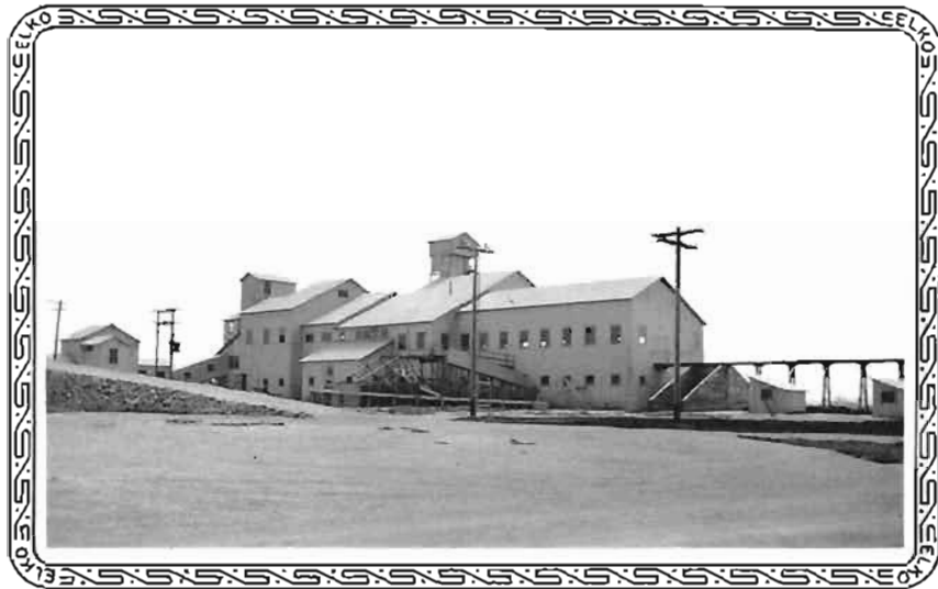
CONCENTRATOR FROM N. W. SHOWING THICKENER AND CONCENTRATE BINS