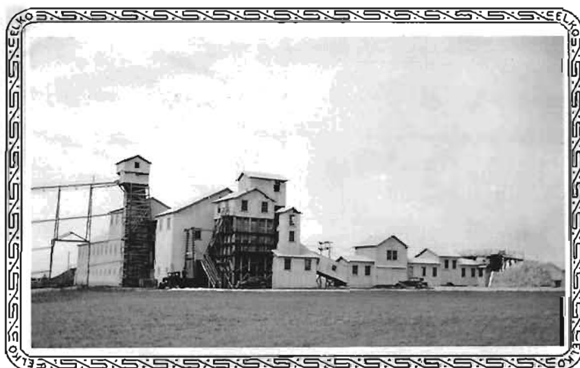
CRUSHING PLANT AND CONCENTRATOR FROM EAST