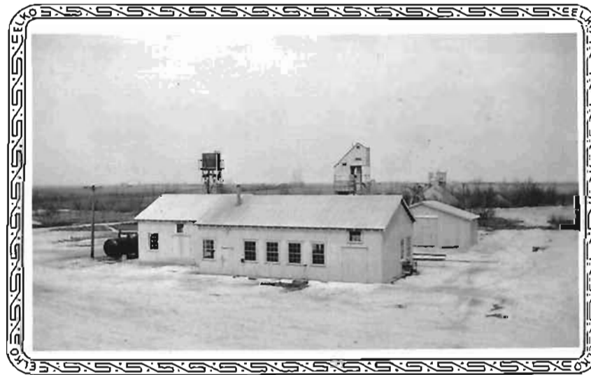
COMPRESSOR PLANT, SHOP, HEAD FRAME AND HOPPER